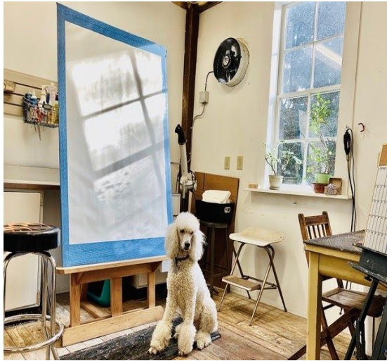
Charcoal Studio in the barn, which has a huge fan for ventilation (also doubles as Poodle Parlor)