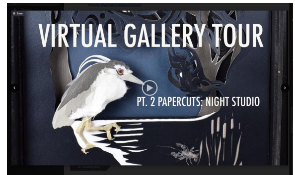
Gallery Tour — Pt 2: Night Studio

Here at Sandhill Designs Studios we are lucky to have a lot of studio spaces. We converted the attic of the garage into my cut paper studio. It's great for smaller projects, but if I want to work large—or need great ventilation— I use a section of the barn Bill uses as a wood-shop. We also have a little photo studio set up in a spare bedroom. This was a boarding house in the 1800's so there are a lot of bedrooms. I waffle between being hyper-organized (losing everything) and being surrounded by stacks of paper (knowing where every scrap is piled).