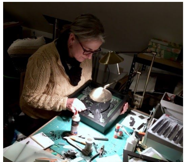
Working on New Process, a cut paper piece in the night studio

Early influences were graphic designers, printmakers and illustrators like M.C. Escher (I was born on his 100th birthday, by the way), Albrecht Durer, and Aubrey Beardsley. From looking at their work, I developed a love of black and white which I still have today. In spite of growing up in a family full of painters, I've always been more comfortable drawing or doing printmaking than painting. In the past few years while exploring the cut paper medium I have looked to the internet and social media and discovered amazing work all over the world. Contemporary artists, many of them fellow members of the Guild of American Papercutters, have had a huge influence on the techniques I've tried. I've just barely scratched the surface.