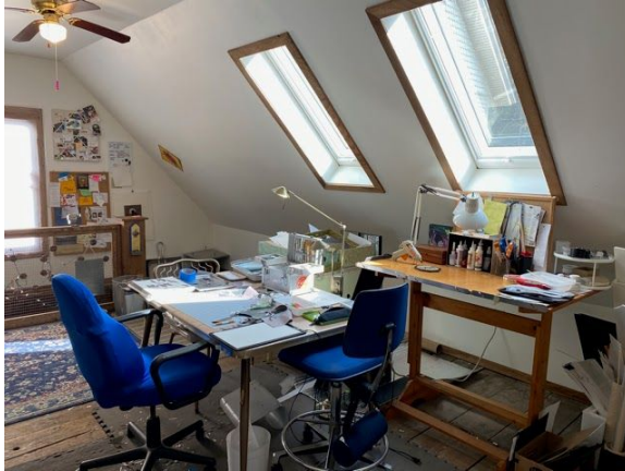
The paper cutting studio above the garage.