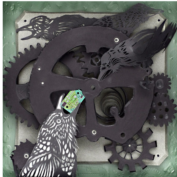
The Mechanical Circus" at 3rd on 3rd Gallery