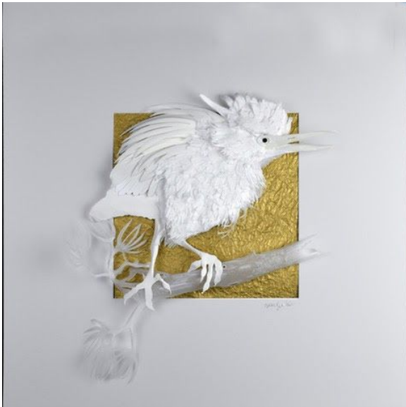
Green on Gold, 24 x 24 Private Collection

I retired from the corporate life on April Fool's day 2019. Before that, I did a lot of work in my studio at night, hence the reoccurring "Night Studio" theme I play with. I used the art to decompress after the stress of the job.